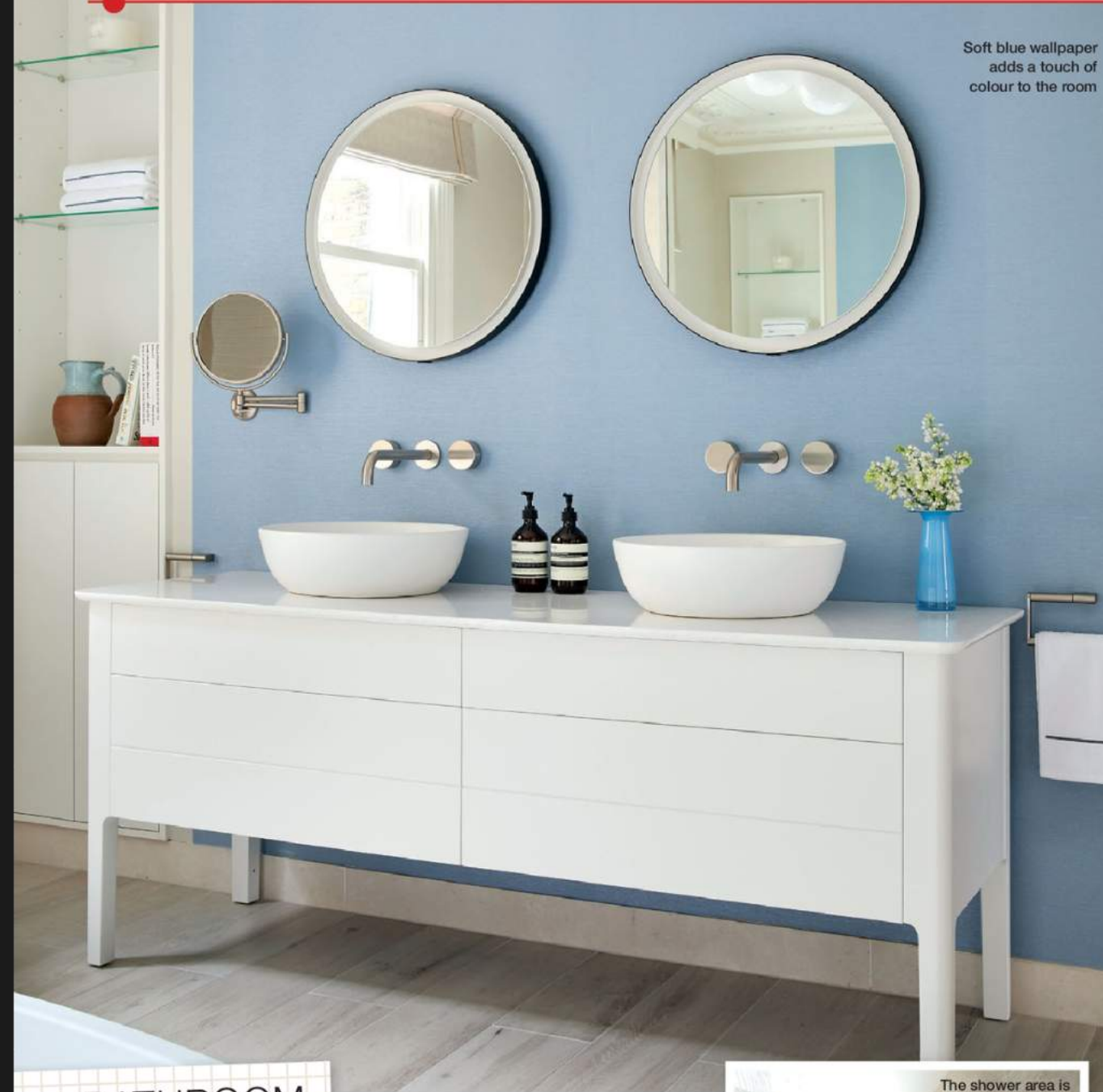
Soft blue wallpaper adds a touch of colour to the room