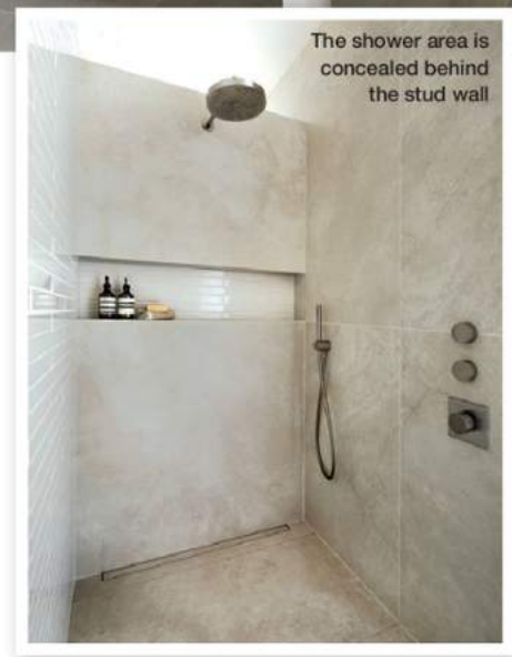
The shower area is concealed behind the stud wall